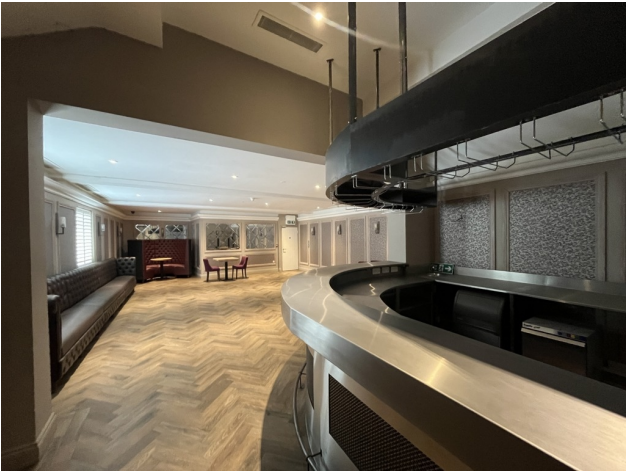
First floor seating