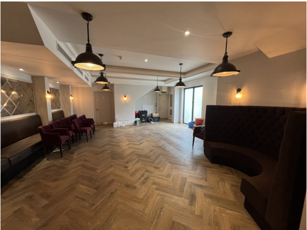
Ground floor seating