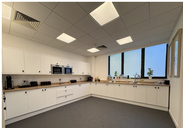
Ground Floor Kitchen