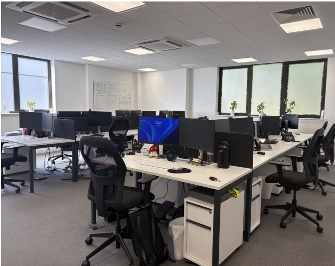
Downstairs Side Office