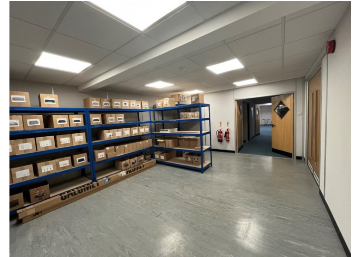
Lab Space 1