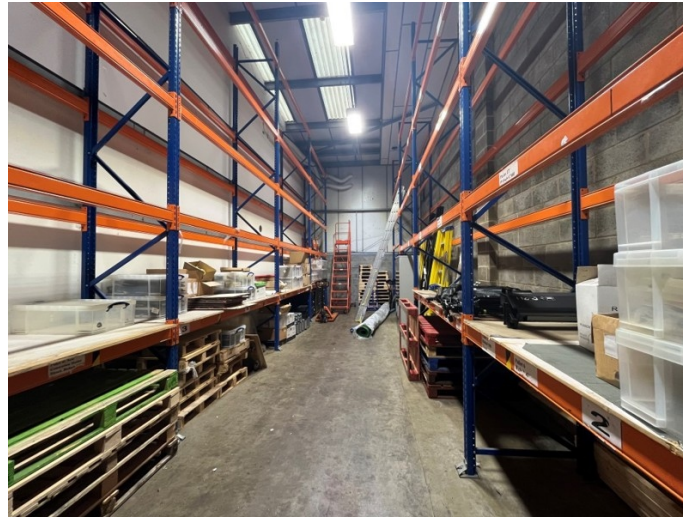
Full Height Warehouse