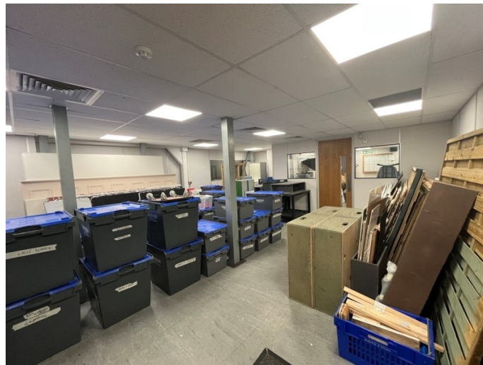
Lab Space 2