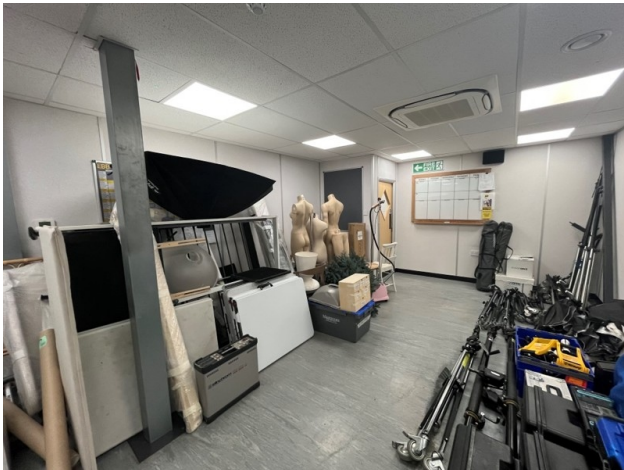
Lab Space 3