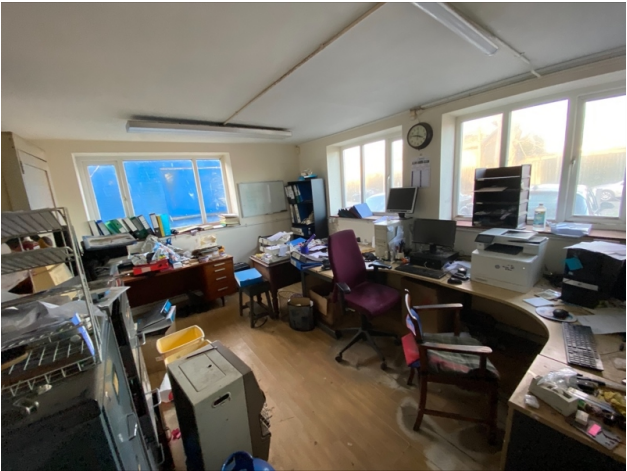
First Floor Office