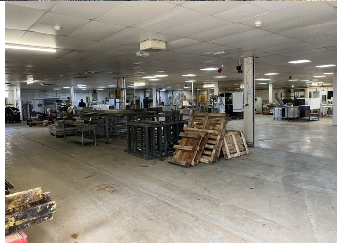
Building 2 internal