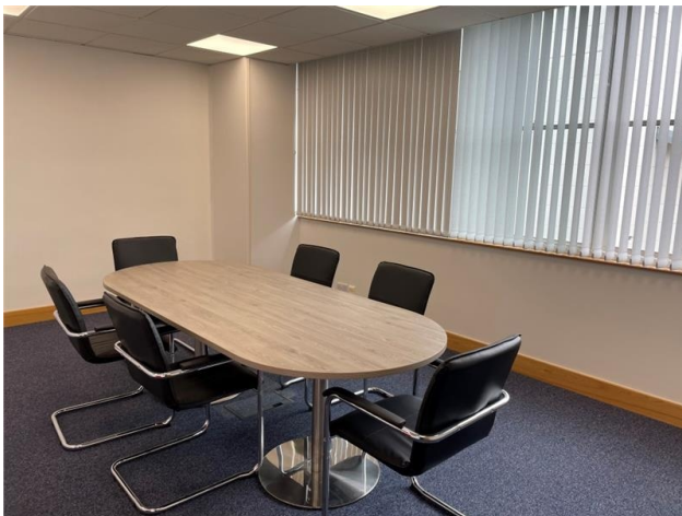
Office with Furniture