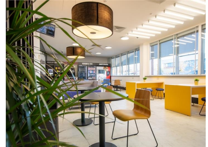
Ground floor break out areas