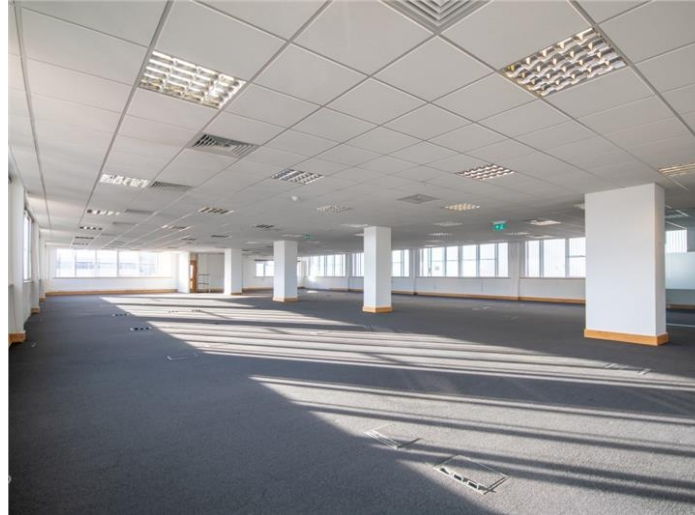
Example of Larger Office Suite

Train station 3.8 Miles M1 (Junction 8) 1.0 Miles M25 (Junction 21a) 3.5 Miles Luton airport 12 Miles Central London 25.0 Miles