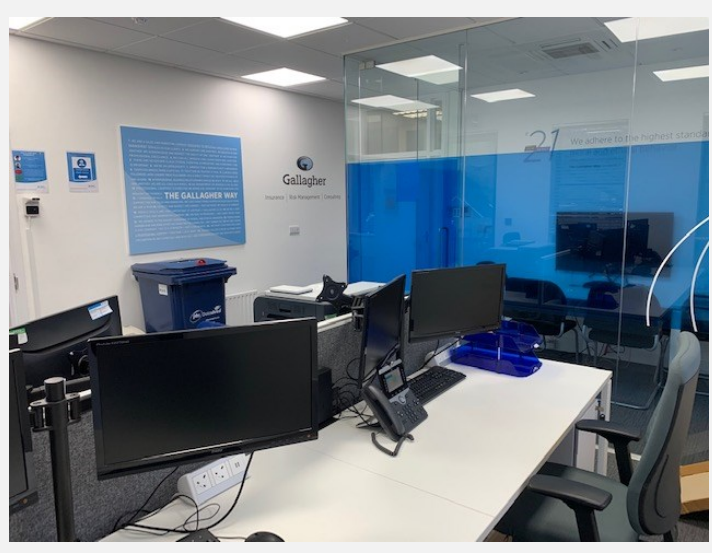
GF Suite 1

Town centre & train station 1.1 Miles M1 (Junction 8) 8.1 Miles M25 (Junction 20) 8.4 Miles