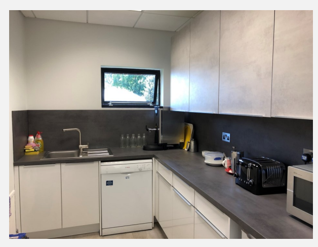
Shared kitchen on first floor