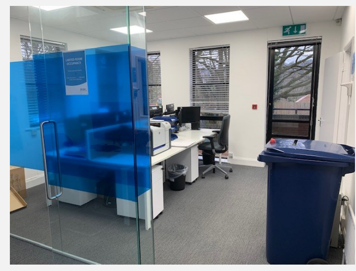
GF Suite 1